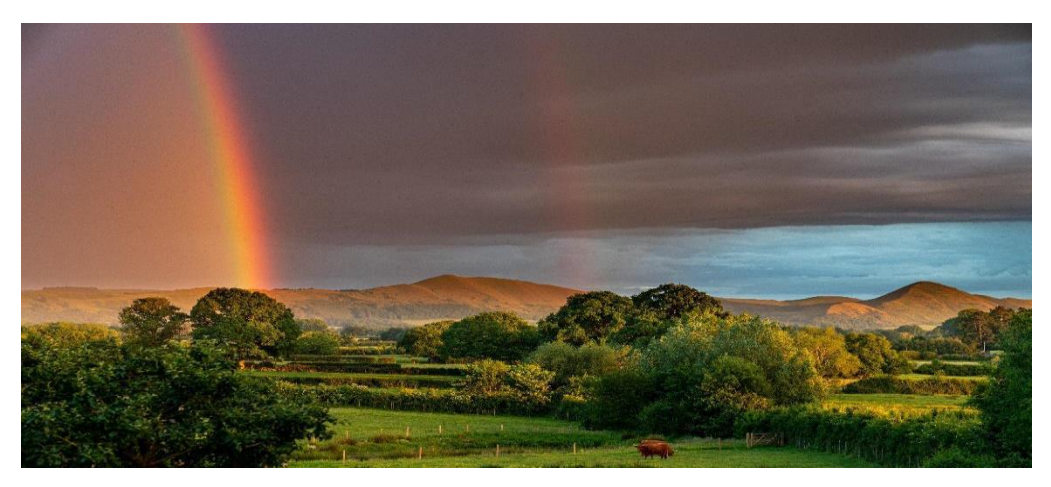
View from the front of the Fox Inn, looking over to the Lawley and Caradoc

The village is a very special place, with strong community cohesion. There is a thriving Village Hall and, prior to its closure, many activities were focused in and around The Fox (see Section 6.1).